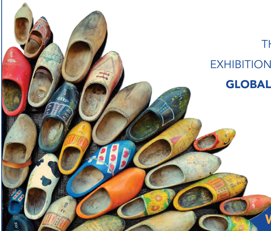
EXHIBIT STAND SALES AND SPONSORSHIPS

THE LEADING INTERNATIONAL EXHIBITION AND CONFERENCE FOR THE GLOBAL POLYURETHANES INDUSTRY